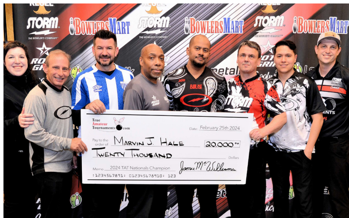
TAT Nationals 2024 Division Finalists in Las Vegas