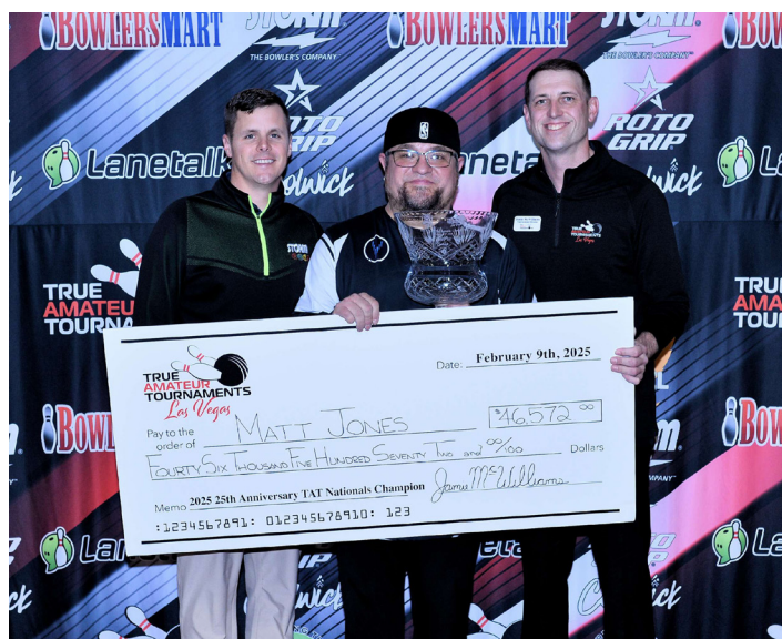
2025 TAT Nationals Champion wins a record $46,572.

Recruiter name must be on original entry form.