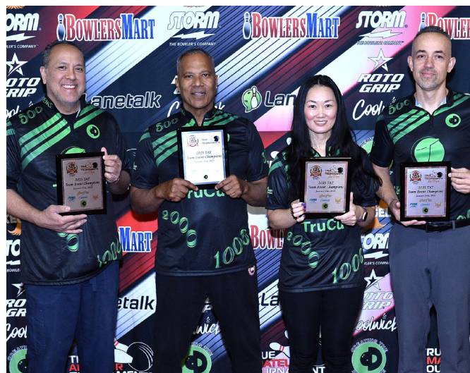
TAT Team Challenge Champions from Las Vegas, NV took home $10,000!